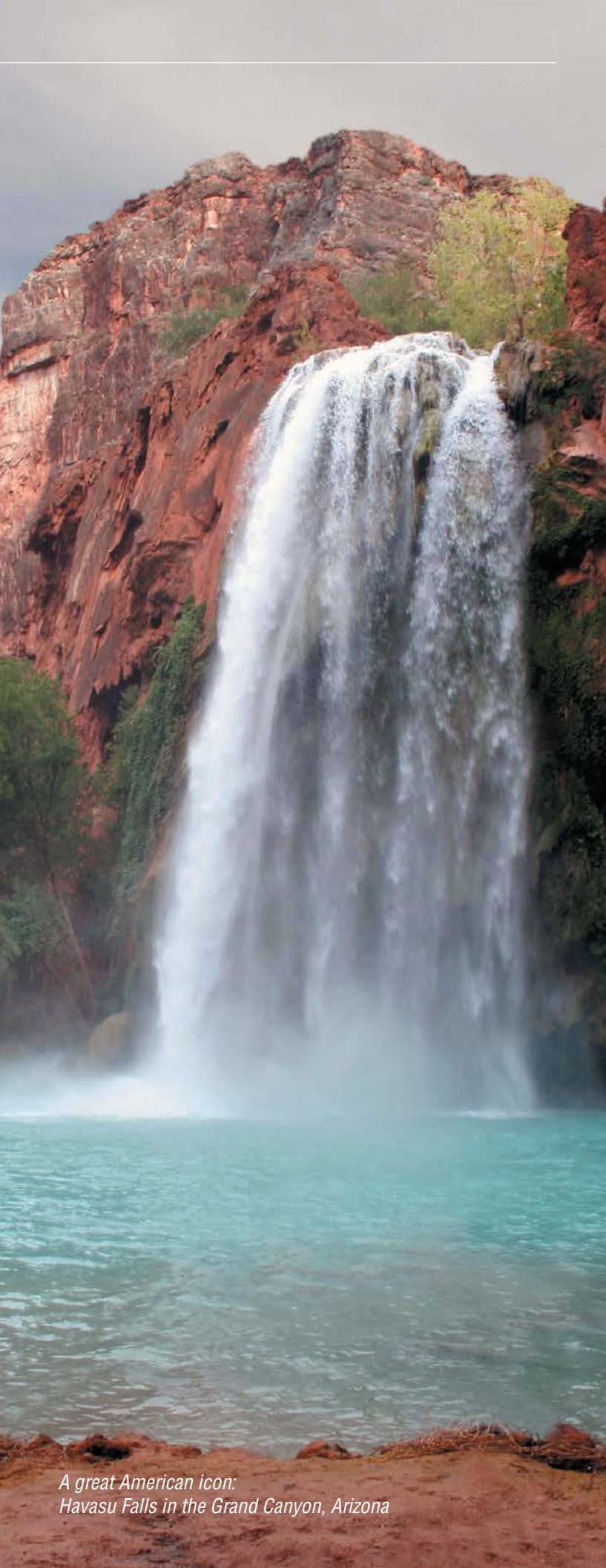
A great American icon: Havasu Falls in the Grand Canyon, Arizona